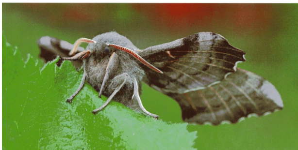
Above: Rachel Piper's winning Poplar Hawkmoth photo