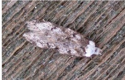
White-shouldered House moth

We have two common species of House Moth that can found flying freely outside but are also very happy living indoors. They are the Brown House Moth and the White-shouldered House moth. They can create colonies feeding on dust, crumbs or any small bits of detritus around the home. For instance a while ago we had a bread bin that seemed designed to trap crumbs that were very difficult to clear out and sure enough we got a small colony of the White shouldered House Moth there. A new bread bin sorted that one out. They are both harmless but not really welcome guests.