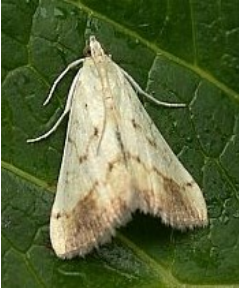
Evergestis extimalis

and 19 micros. Of the macros Black Arches, Iron Prominent and Swallowtail were the most interesting. All the others were common moths in Harrow.